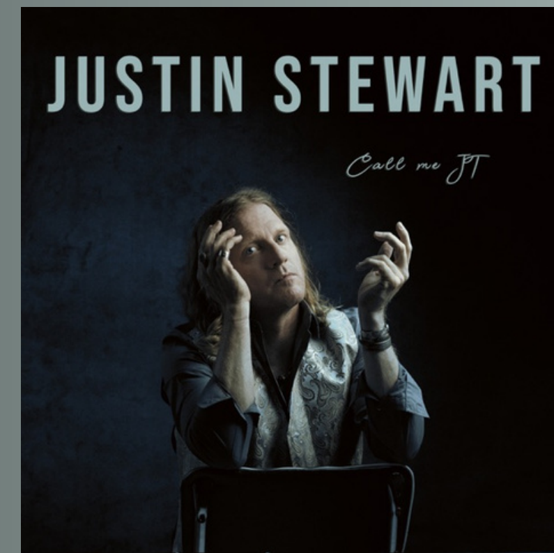
Call Me JT 2023